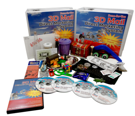
You'll get a $200 Gift Certificate from 3D Mail Results to be used on any 3D Mail Results Product when you invest in the 3D Mail Direct Marketing System and take advantage of my Triple Your Money Back Guarantee.

If you visit my website (www.3DMailResults.com), you'll see the 3D Mail Direct Marketing System sells for $397. But during this special, limited-time offer, you can get it for just $247, 38% off the retail price. You only have a short time, so do not delay.